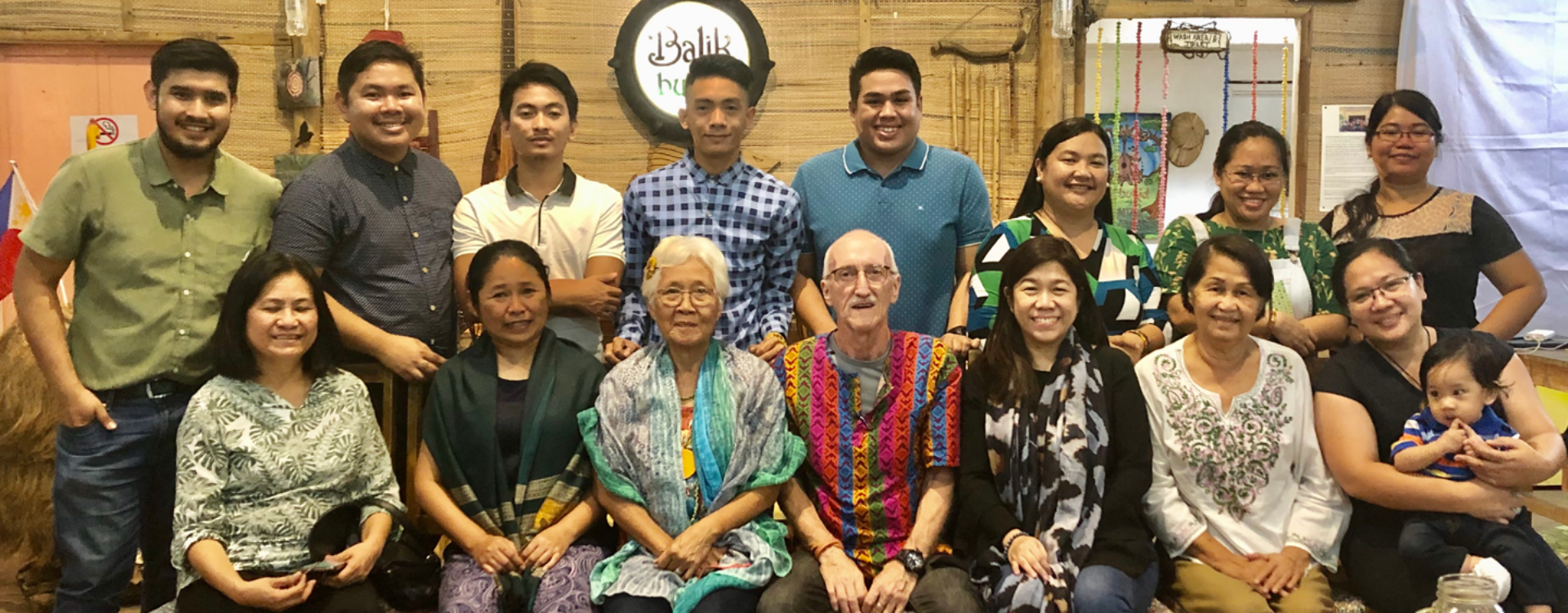
As IDIS celebrated its 20th founding anniversary, some of its founders and Board of Trustees gathered together with the existing staff.