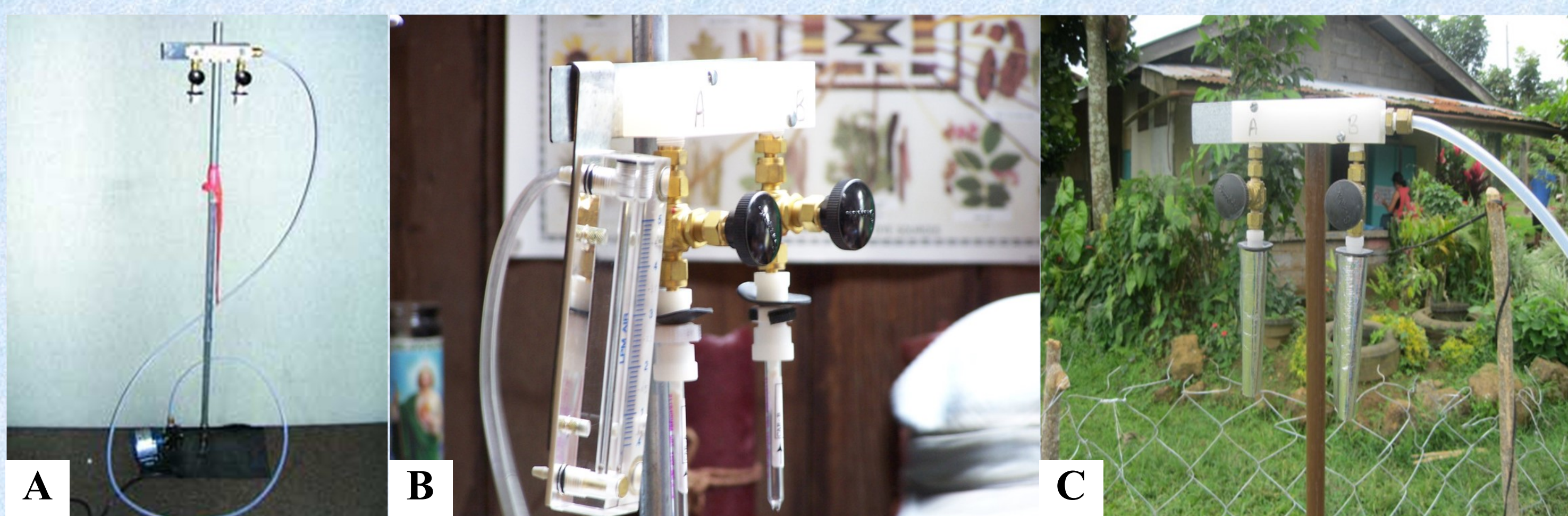
Figure 2. The drift catcher (A) with the rotameter to measure the air flow (B) and sample tubes covered with light shields to protect from sunlight (C).