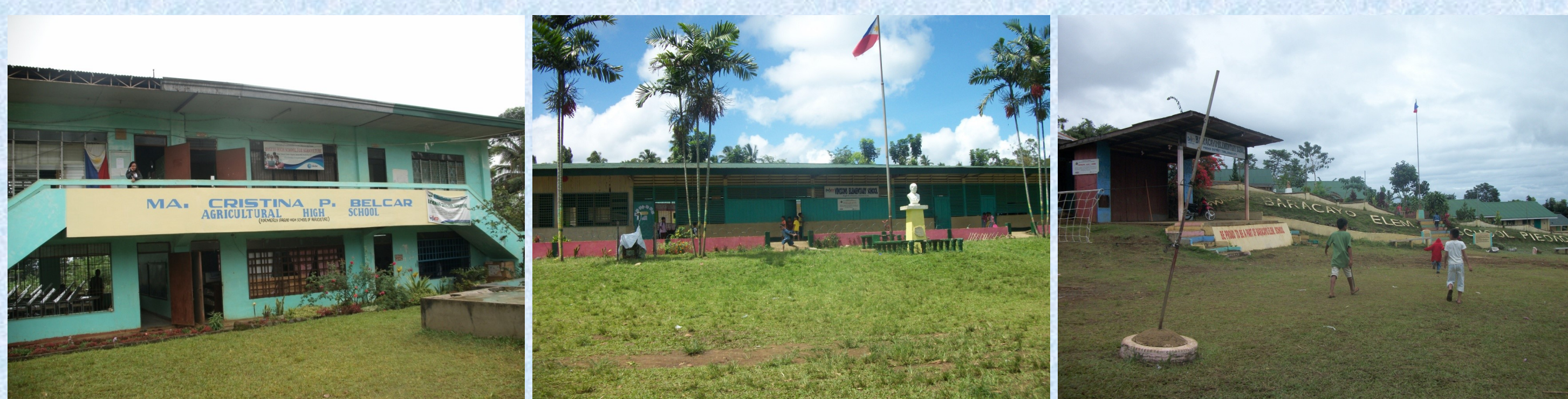
Figure 1. The three selected sampling stations in Davao City